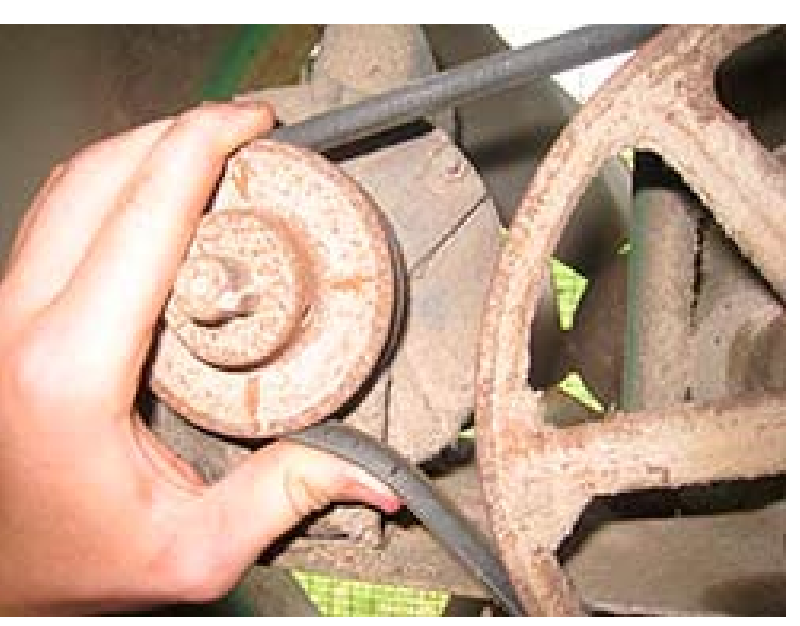
Loose or cracked fan belts, as shown in above photo, can cause lowered airflow as well as threaten complete loss of airflow when the belt breaks. Worn belts or motor pulleys are often overlooked, and will cause lowered fan rpm's and reduced house air flow.

Worn fan belts ride low in the motor pulley, as shown in top photo above. Result: blade rpm's are greatly reduced, thus robbing cfm's, air speed and wind chill cooling. Belts should be tight and ride high in the motor pulley, as in bottom photo, to achieve maximum fan rpm's and best wind-chill and evaporative cooling. NOTE: The same effect is caused by a worn pulley, even if belt is new. Retensioning the belt will not cure either problem, worn belt or worn pulley.